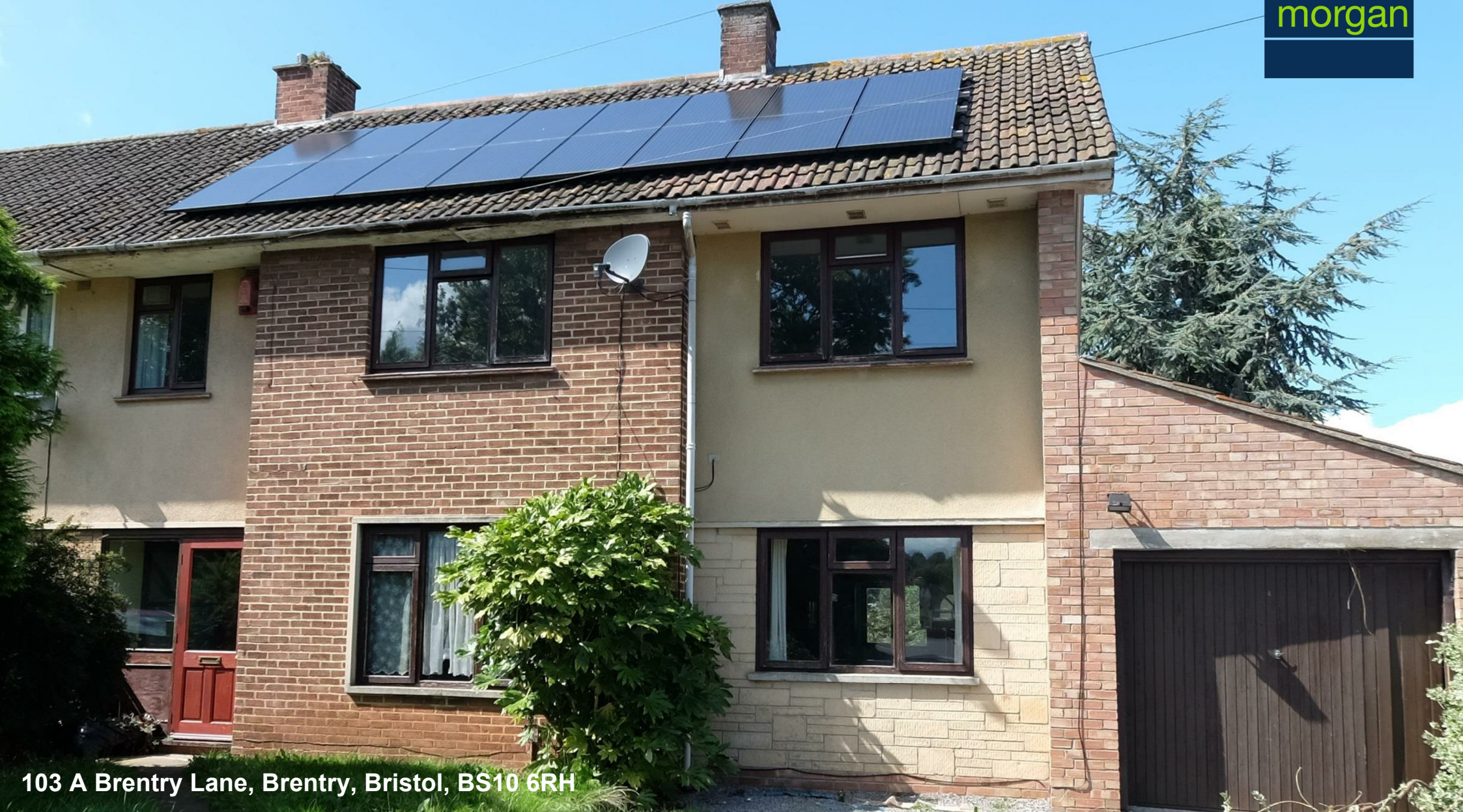
103 A Brentry Lane, Brentry, Bristol, BS10 6RH Sold @ Auction £360,000